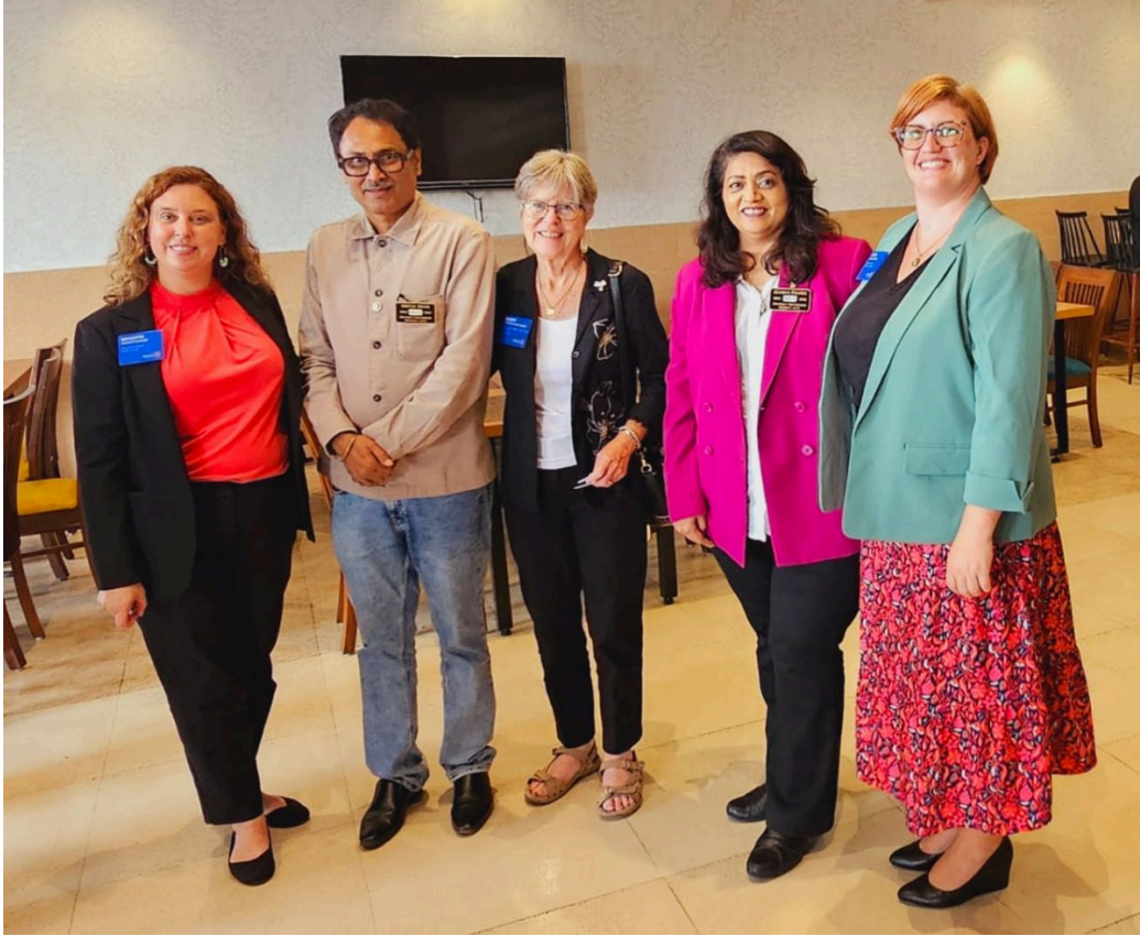
Visit of Asia Rotary Peace Center Search Committee delegates to District 3131 - Pune, India

The search committee was also impressed by District 3131's organization and collaboration, as well as their commitment to cross-cultural exchange and extensive local service partnerships. The Trustees are confident that members of District 3131, along with members of neighboring districts, will welcome peace and development leaders from across the region and provide meaningful opportunities for their engagement with Rotary.